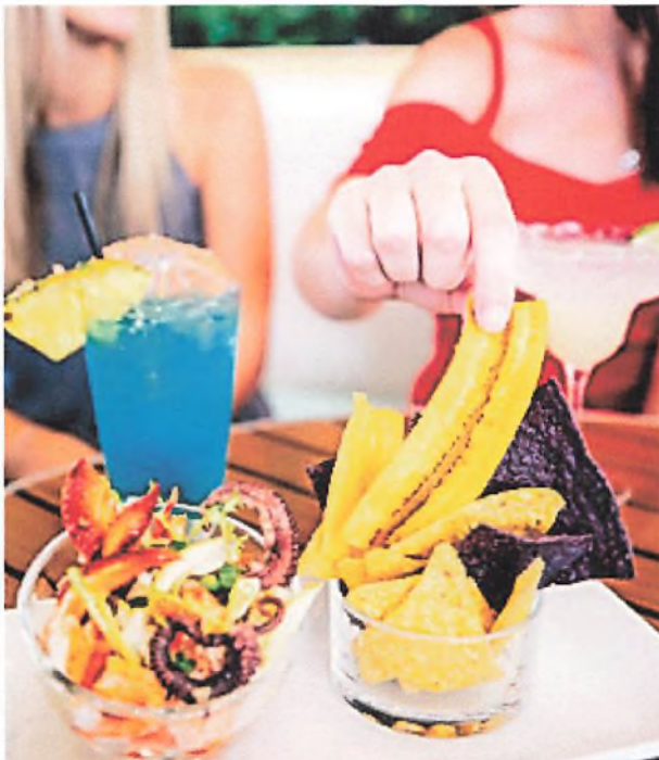
EAT & DRINK